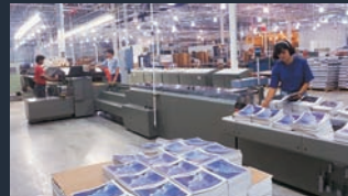
Printing Press Machinery