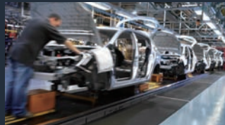
Automotive Assembly Line