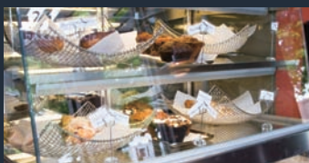
Freezer • Refrigerator Showcase