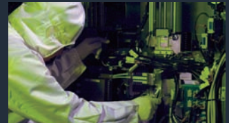
Semiconductor Production (Amber Lighting)