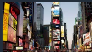
Billboard • Sign Backlighting