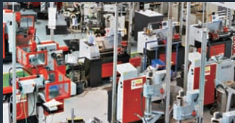
Various Automation Machinery